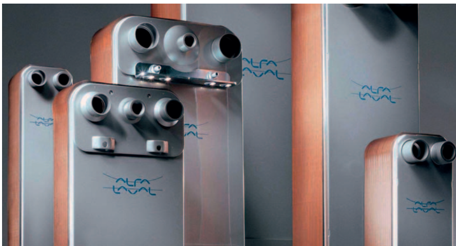
New Brazed Plate Pack